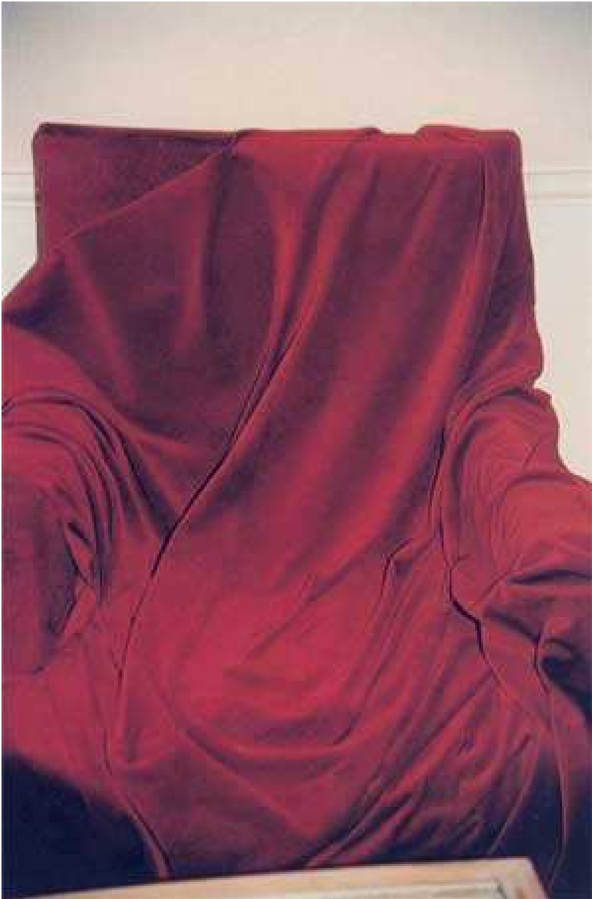
Vancouver Estival Trivia Open, 2007, FAR SIDE team